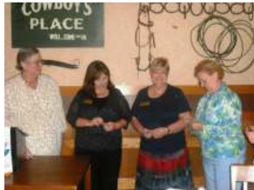
Officers receiving their pins